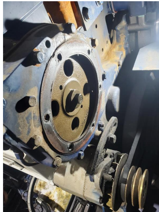
Figure 2 Cover Removed