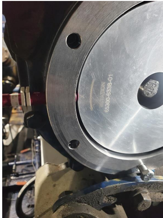
Figure 3. Spacer installed, disc installed and aligned