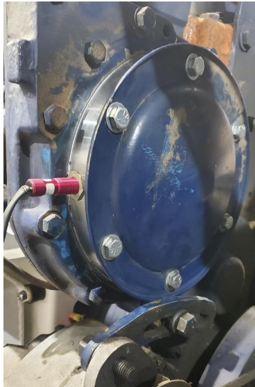
Figure 4. Cover re-installed